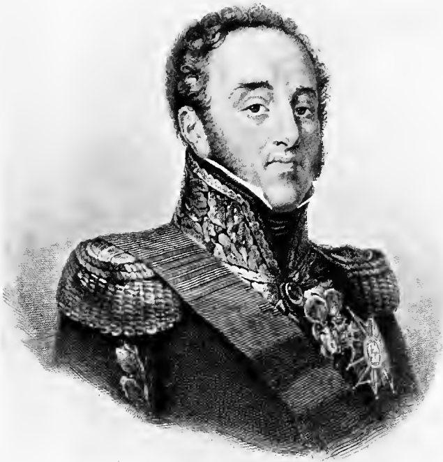
LOUIS GABRIEL SUCHET, DUKE OF ALBUFERA FROM AN ENGRAVING BY FOLLET